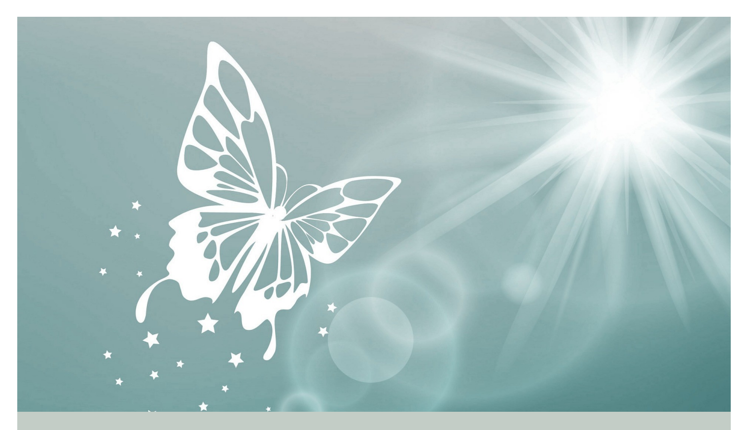
Caring for Clallam County since 1978